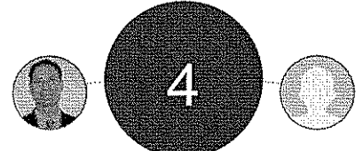
Skills & Expertise

Duke University BSE, Electrical Engineering & Computer Science 1995 – 1999